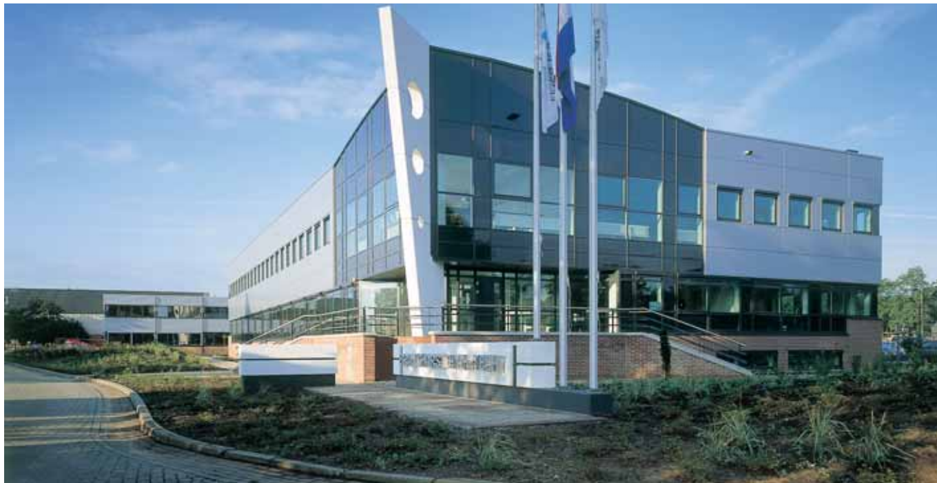
BRONKHORST HIGH-TECH HEADQUARTERS, THE NETHERLANDS